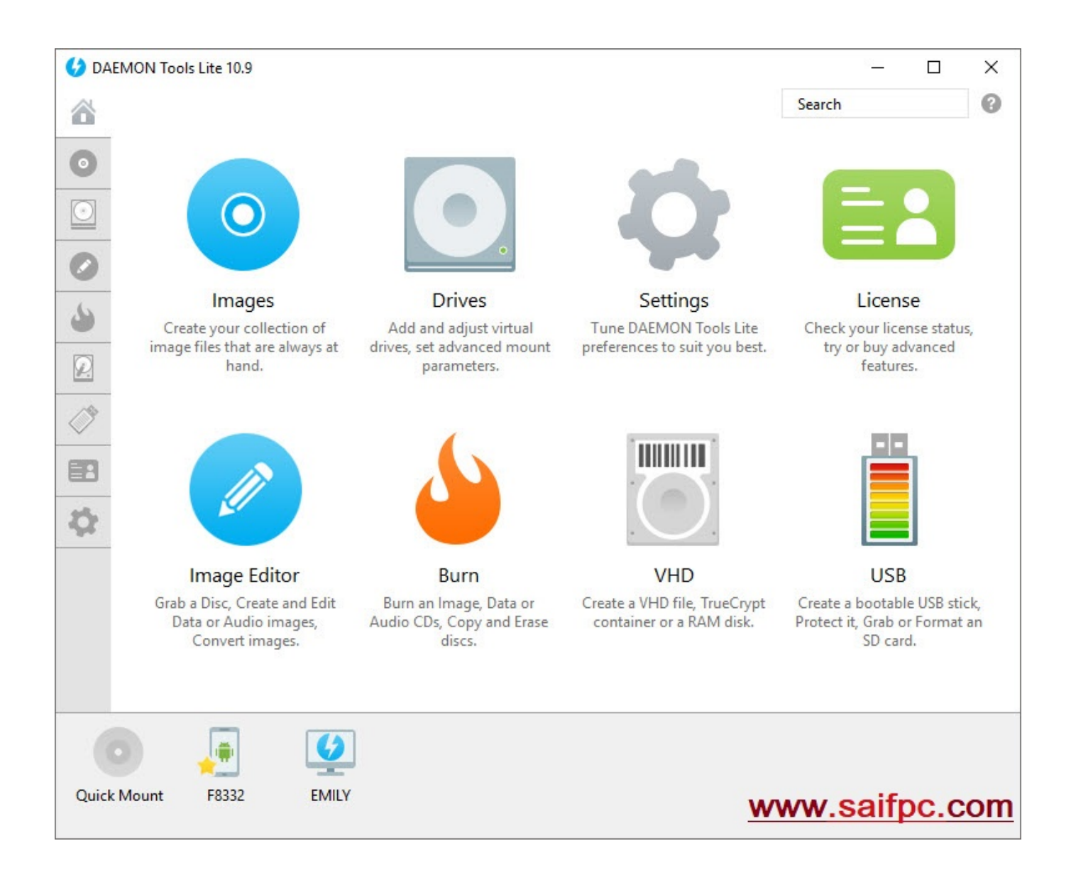
DAEMON Tools Lite Crack Activation Key Free Download MacOSX